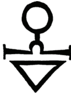
Figure 1. Kyklos Symbol of the Leipzig Institute of the History of Medicine

This was to express the thought that when medicine, conscious of its historical position and permeated by philosophy, is guided by the intellect, then the pathway to a better and more perfect medicine results, expressed by the circle. (Kästner 1997: 48)